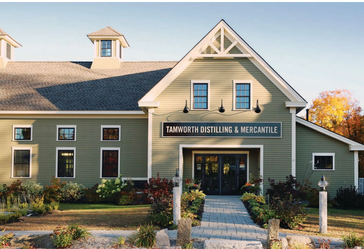
Right on the main street, the distillery’s address is 15 Cleveland Hill Road in Tamworth.

Oakes, with support from Tamworth Distilling, studied at Moonshine Uni-