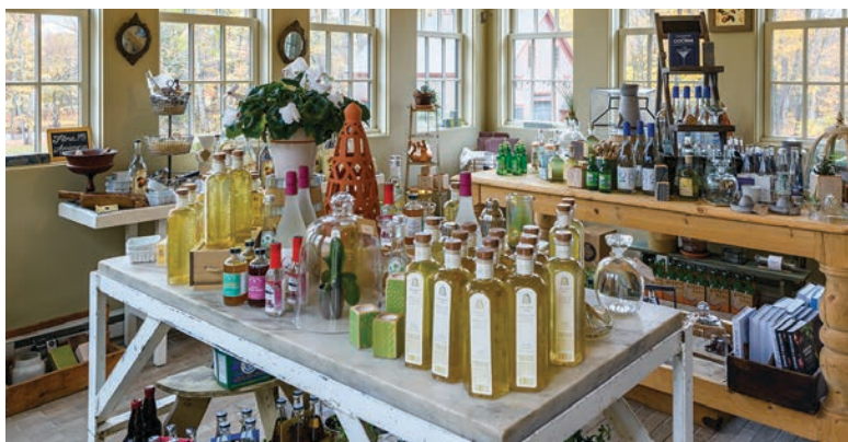
Top left: The tasting bar line up. Right: Custom-built in Louisville, Kentucky, the 250-gallon Vendome copper still sports a brandy helmet. Bottom left: The distillery's showroom caters to a wide range of tastes.